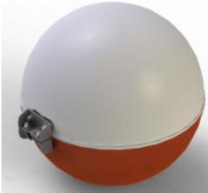
Mounting dimension (unit : mm)